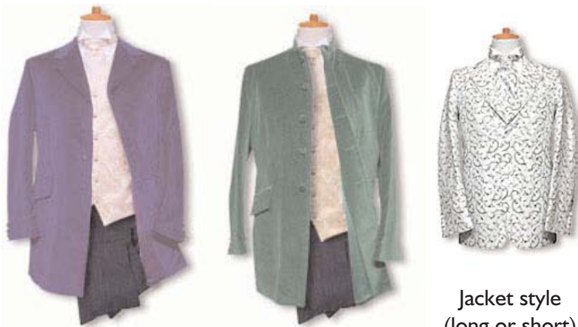
Frock Coat style Nehru Jacket style

AVAILABLE IN A LARGE RANGE OF COLOURS IN VELVET OR EMBROIDERED SILK Fabric samples are supplied before we make Coats or Jackets Worcester Nehru Jacket £360.00 each Velvet Coats and Jackets £349.00 each Embroidered Silk Coats and Jackets £449.00 each Midriff size over 50" please add £15.00 each Multiple orders quoted separately PLEASE ALLOW 6/8 WEEKS FOR DELIVERY