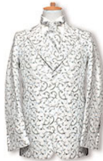
Jacket style (long or short)