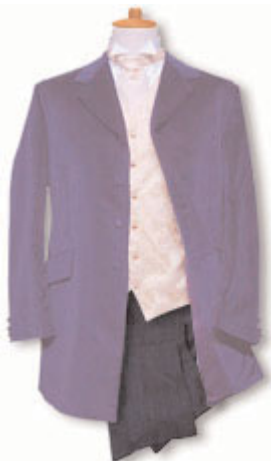
Frock Coat style

AVAILABLE IN A LARGE RANGE OF COLOURS IN VELVET OR EMBROIDERED SILK Fabric samples are supplied before we make Coats or Jackets Velvet Coats and Jackets £330.00 each Embroidered Silk Coats and Jackets £435.00 each Multiple orders quoted separately PLEASE ALLOW 6/8 WEEKS FOR DELIVERY