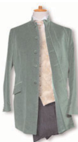
Nehru Jacket style